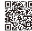
Healthy walking: "Kurort Path"